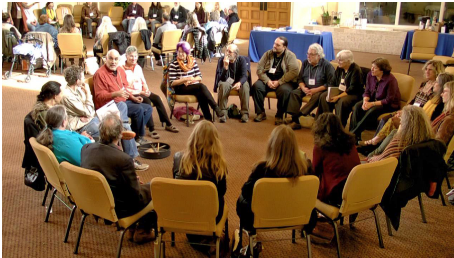
Breakout session with Tim Cope, "Wisdom from Our Wild Relations"